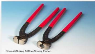
Normal Closing & Side Closing Pincer