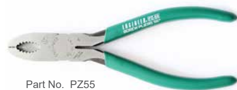
Part No. PZ55