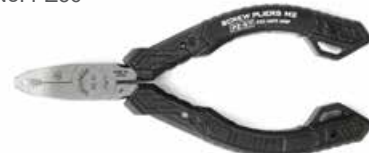
Part No. PZ57