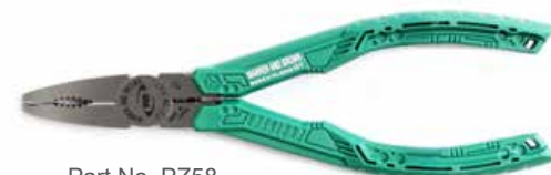
Part No. PZ58