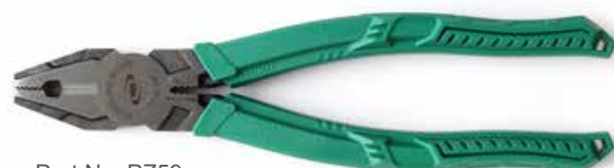
Part No. PZ59