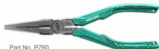
Part No. PZ60