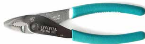
Part No. PZ56